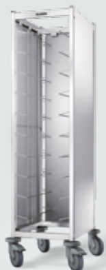
TAW 10 GN with panelling on 3 sides, stainless steel