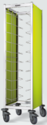
TAW 10 GN with panelling on 2 sides, colour: lime